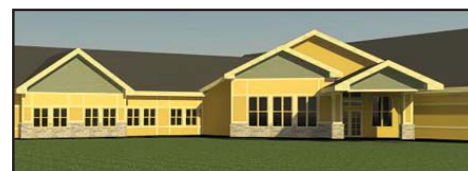
An artist's rendering of the Ambassador Good Samaritan addition.

Ambassador Good Samaritan broke ground on a 15,180 square foot expansion of its nursing care facility at 8100 Medicine Lake Road on May 4. The new wing, which will be attached to the north end of the existing building, will house 21 private rooms for short-term adult patients who require rehabilitation after leaving the hospital. As part of the $4.6 million project, 21 two-bed rooms in the existing 34,100 square foot, 85-bed care facility will be converted to private rooms. Other improvements will include extensive landscaping including a rain garden, and installation of a 1000 kilowatt diesel